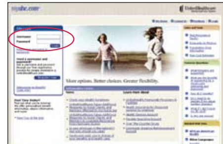
Logging on to myuhc.com