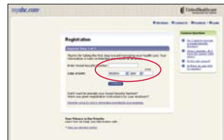
Enter your SSN# and Date of Birth or subscriber ID number.