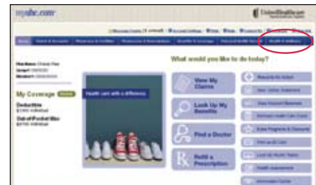
Accessing the Online Coach - “Health & Wellness” tab